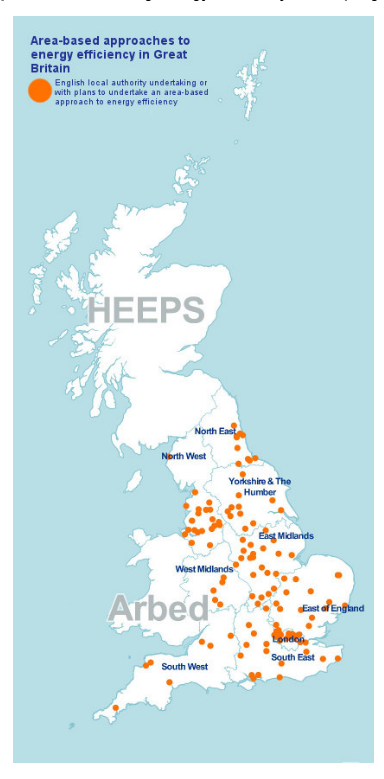
Figure 2. Local authorities that are undertaking or have plans to undertake an area-based approach to delivering energy efficiency works programmes